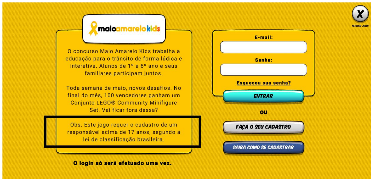
Register Menu Screen of the game