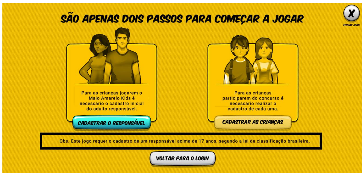
Register Screen of the game